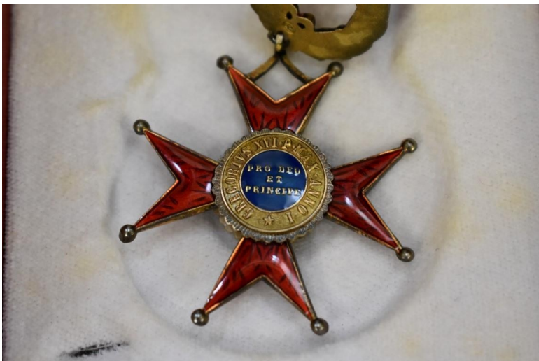
Medal of Papal Order of the Knight of St Gregory the Great