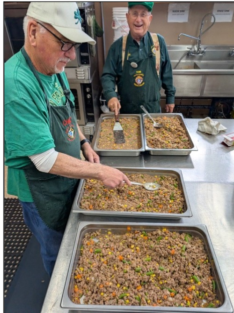
Shepherd's Pie in Progress

On March 12, 2020, the luck of the Irish ran out when Nevada declared a "state of emergency" due to the COVID-19 pandemic. This effectively cancelled the Ponderosa Council 4928 Holy Cross Catholic Community St. Patrick's Day dinner scheduled for March 20. Due to the generosity of our members and that of our parishioners, virtually all ticket sale receipts were not refunded but donated to the Diocese of Reno Seminarian Education Fund.