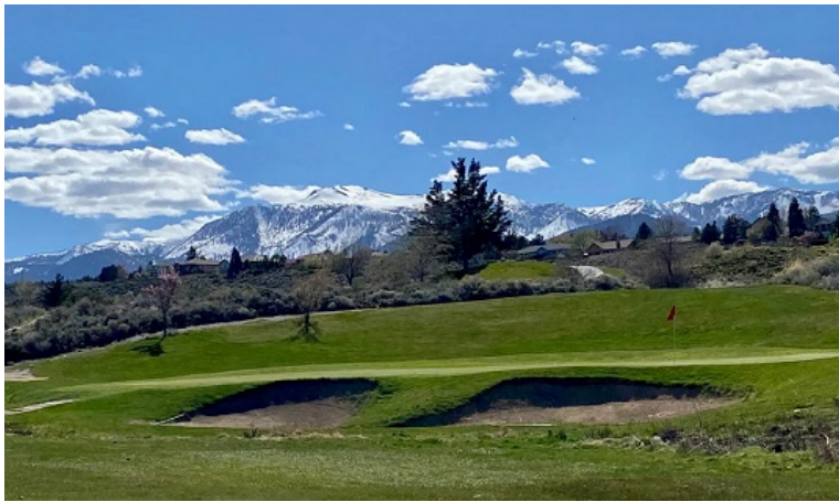
Fourth hole at Wolf Run

Join your fellow Knights for a round of golf at Wolf Run Golf Course on Friday, May 2. The course is a pleasure for golfers at any skill level to play. You can't test your accuracy on their fairways, water hazards and sand traps. The facilities include a practice putting green, beautiful new chipping green with patio seating, and a newly remodeled driving range with a 100-yard short game area to practice chips and sand shots. The Grill at Wolf Run offers impeccable service and food. Wolf Run Golf Course prides itself on being the home course to the University of Nevada Men's and Women's Golf Teams.